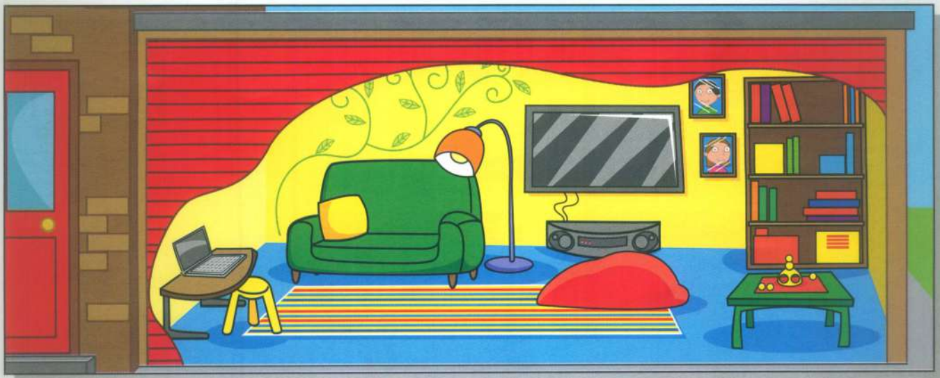
table sofa bed bath fridge lamp

11 Read the text. Where is the playroom?