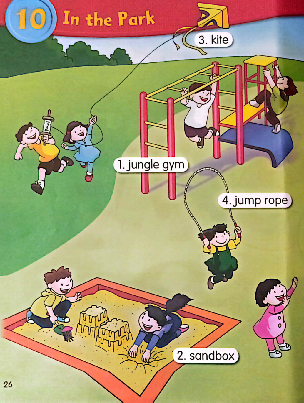
1. jungle gym