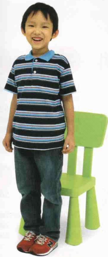
4. stand up