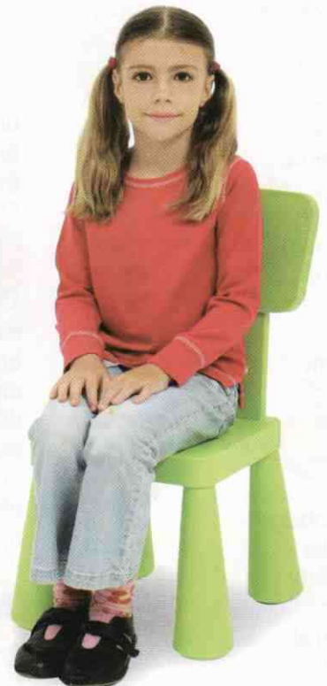
9. sit down