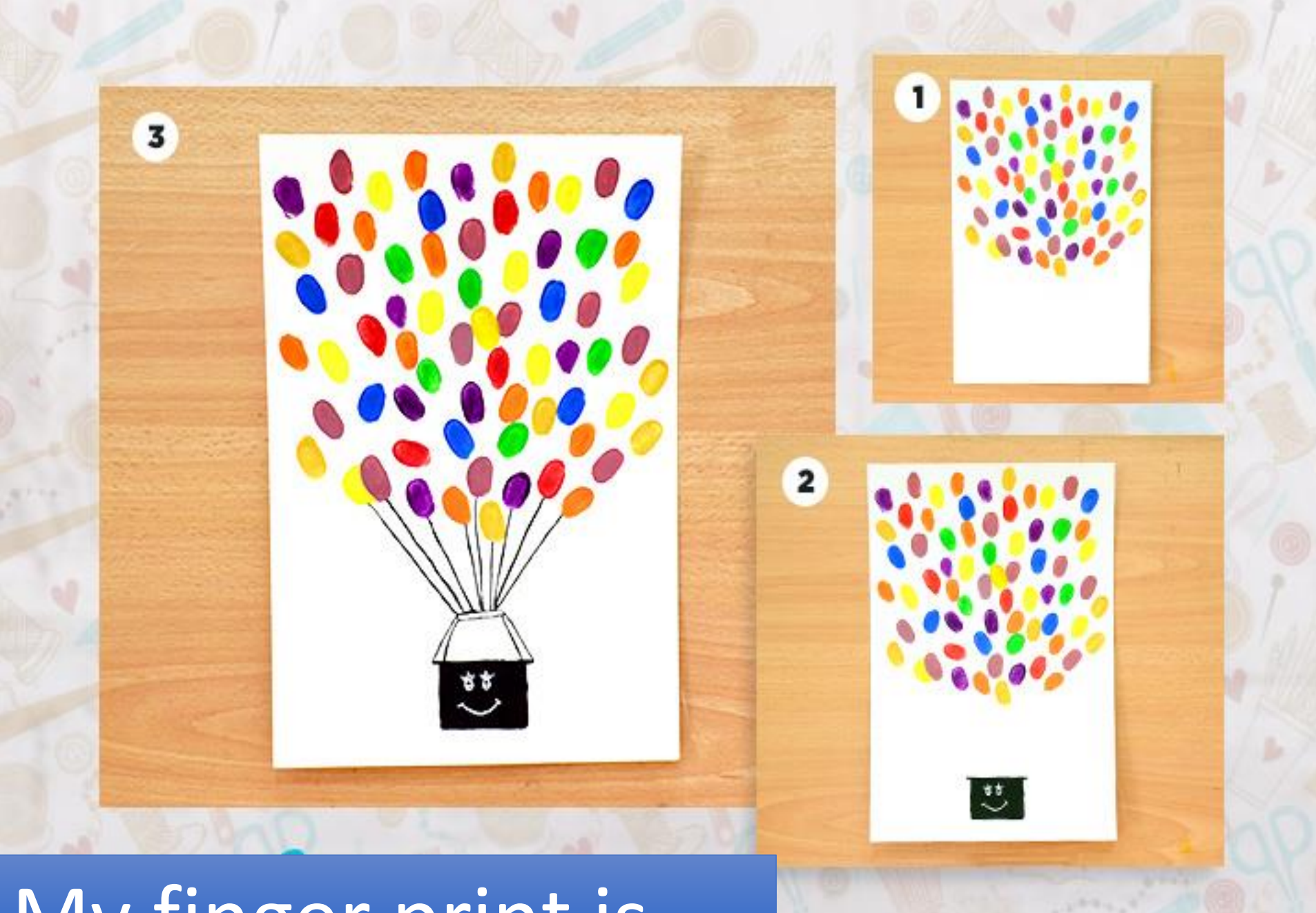
My finger print is ...