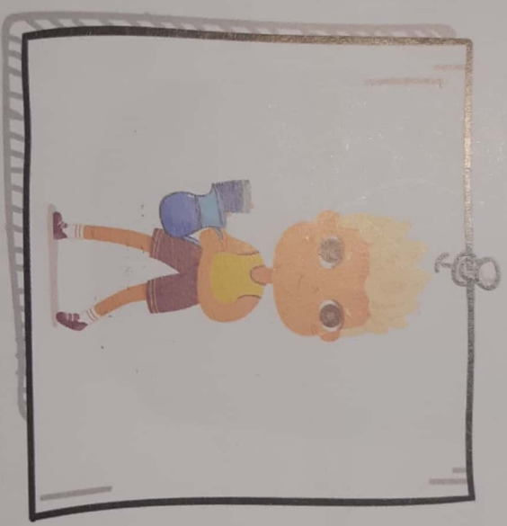
Water is a liquid .