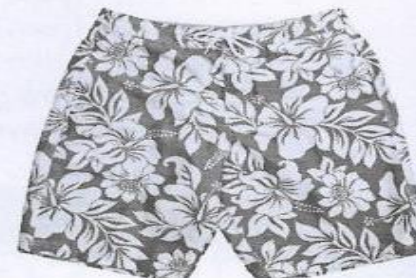
8 swimming shorts