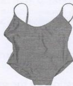
3 swimming costume