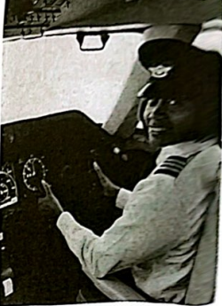
8 She's a pilot / nurse.

2 Which job doesn't belong in each category?