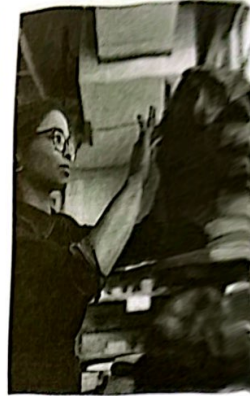
4 She's an artist / a sports coach.