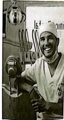
3 He's a police officer / dentist.