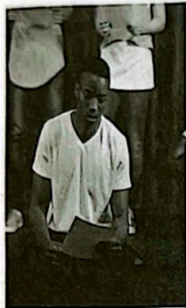
5 He's a manager / an actor.