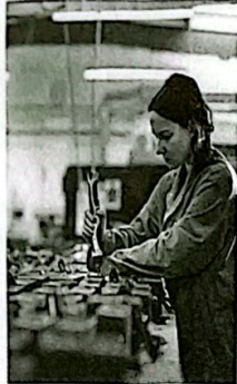
6 She's a factory worker / shop assistant.