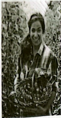
1 She's a farmer / mechanic.

1 Choose the correct words to complete the sentences.