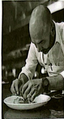
2 He's a cook / engineer.