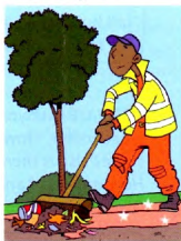
4 clean ____