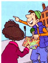
2 friendly ____