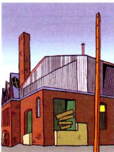
5 ugly ____