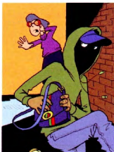
1 dangerous ____

quiet dirty safe unfriendly pretty modern