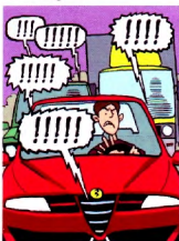
3 noisy ____