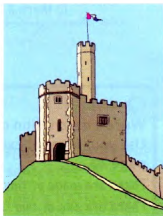
6 old ____