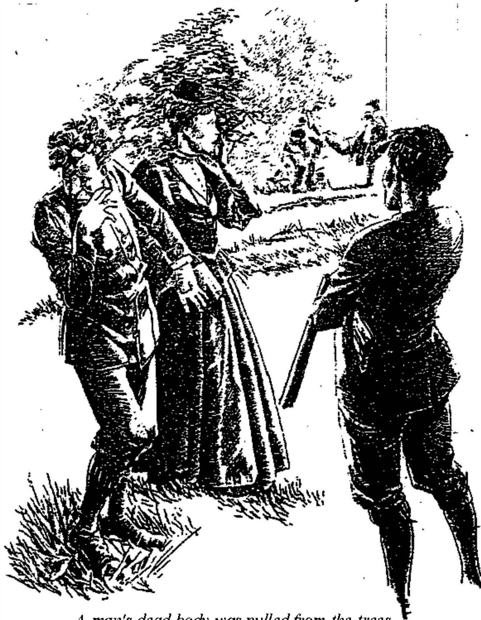
A man's dead body was pulled from the trees.

There were shouts and calls from the men, and then a man's body was pulled from the trees. Dorian turned away in horror. Bad luck seemed to follow him everywhere.