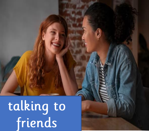
talking to friends