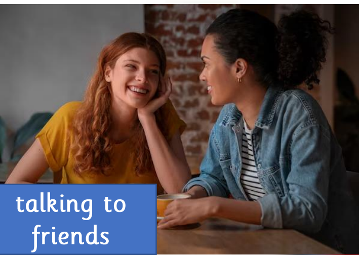
talking to friends