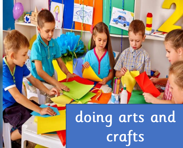
doing arts and crafts