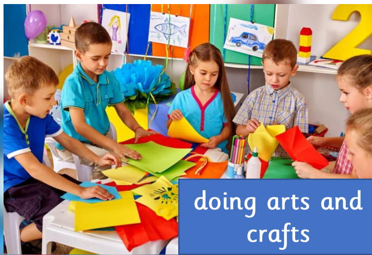
doing arts and crafts